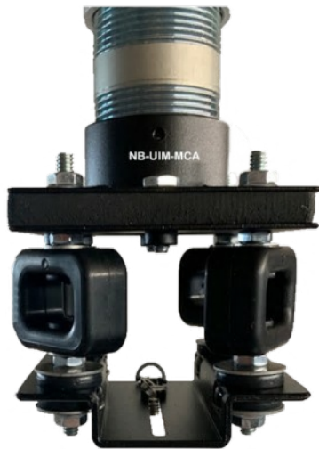
Anti-Vibration Gasket A Nigel B Design Exclusive Feature

It is important that the Installer maintains the correct position of the pipe assembly with respect to the center of gravity, failure to do so can affect premature failure of the Adaptor and also for the entire assembly to be out of balance. Simply turn the adaptor clock wise until it is secure on the pipe. All installs are different so you may need to loosen the screw at the top of the adaptor. Once its secure you can attach your PTZ camera using the tripod screws.